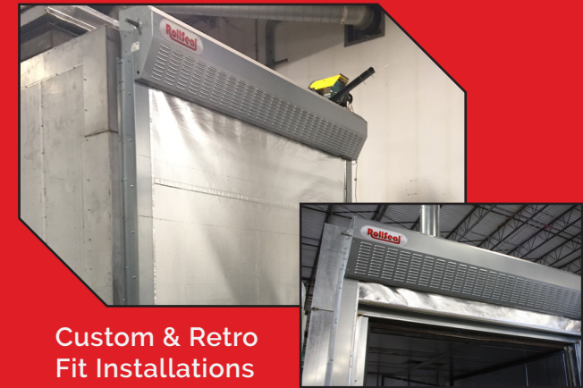
Custom & Retro Fit Installations

Field trials have shown identical heat retention and energy consumption over an R-32 swing door. Additionally, an average of 65% decrease in temperature from the inside panel to the outside panel.